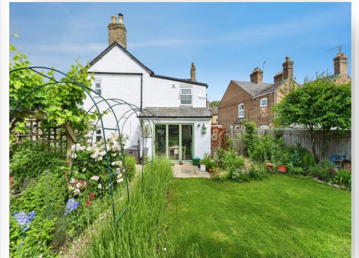
Whytefield Road, Ramsey PE26 1AQ