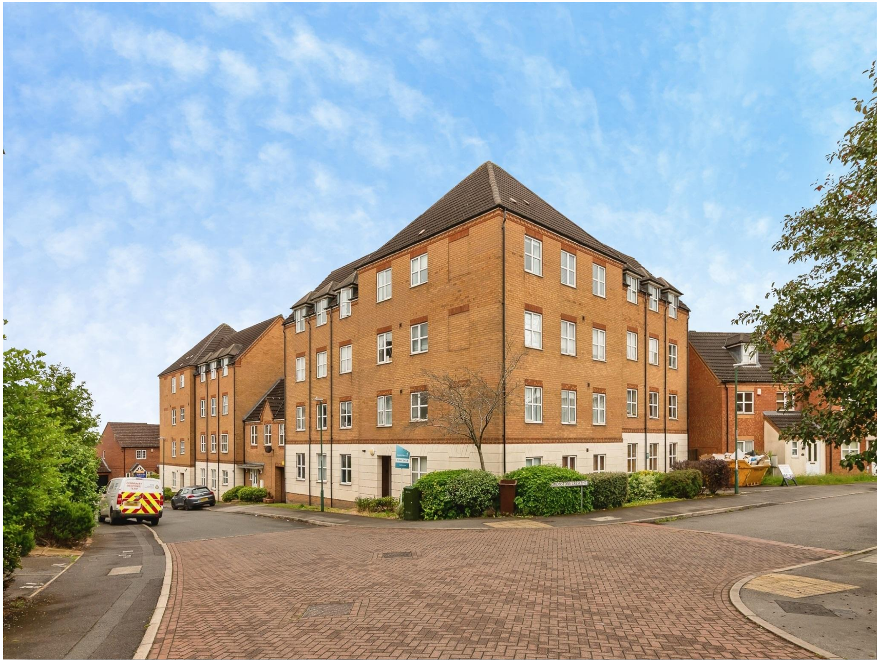
Pavior Road, Nottingham NG5 5UE