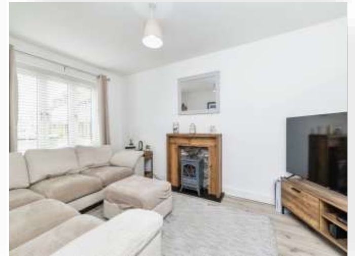
Golden Meadows, Hartlepool TS25 1GW