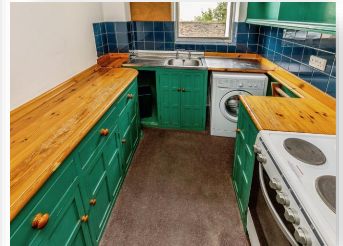
Clifton Park, Clifton Bristol BS8 3BU