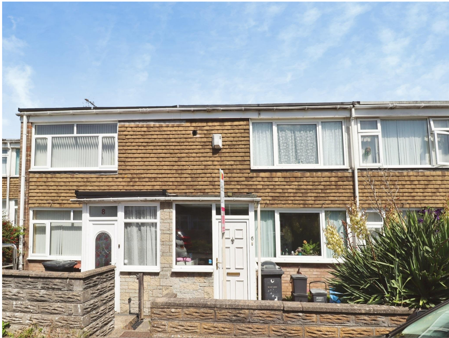
Iminster Close, Barry CF63 1BU