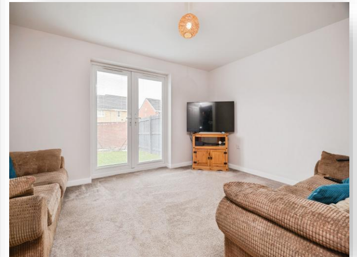
Aristotle Drive, Stockton-On-Tees TS19 8GH