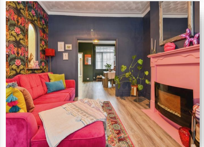
Eton Road, Stockton-On-Tees TS18 4DL