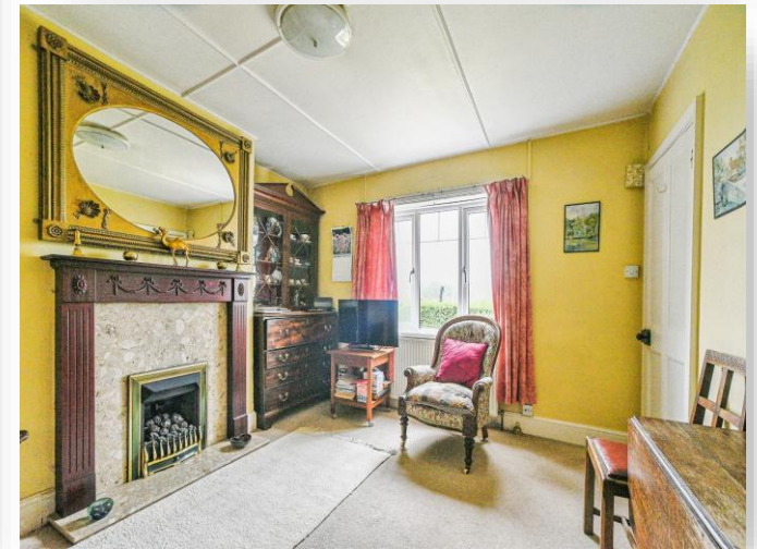
St. Ediths Marsh, Bromham Chippenham SN15 2DJ