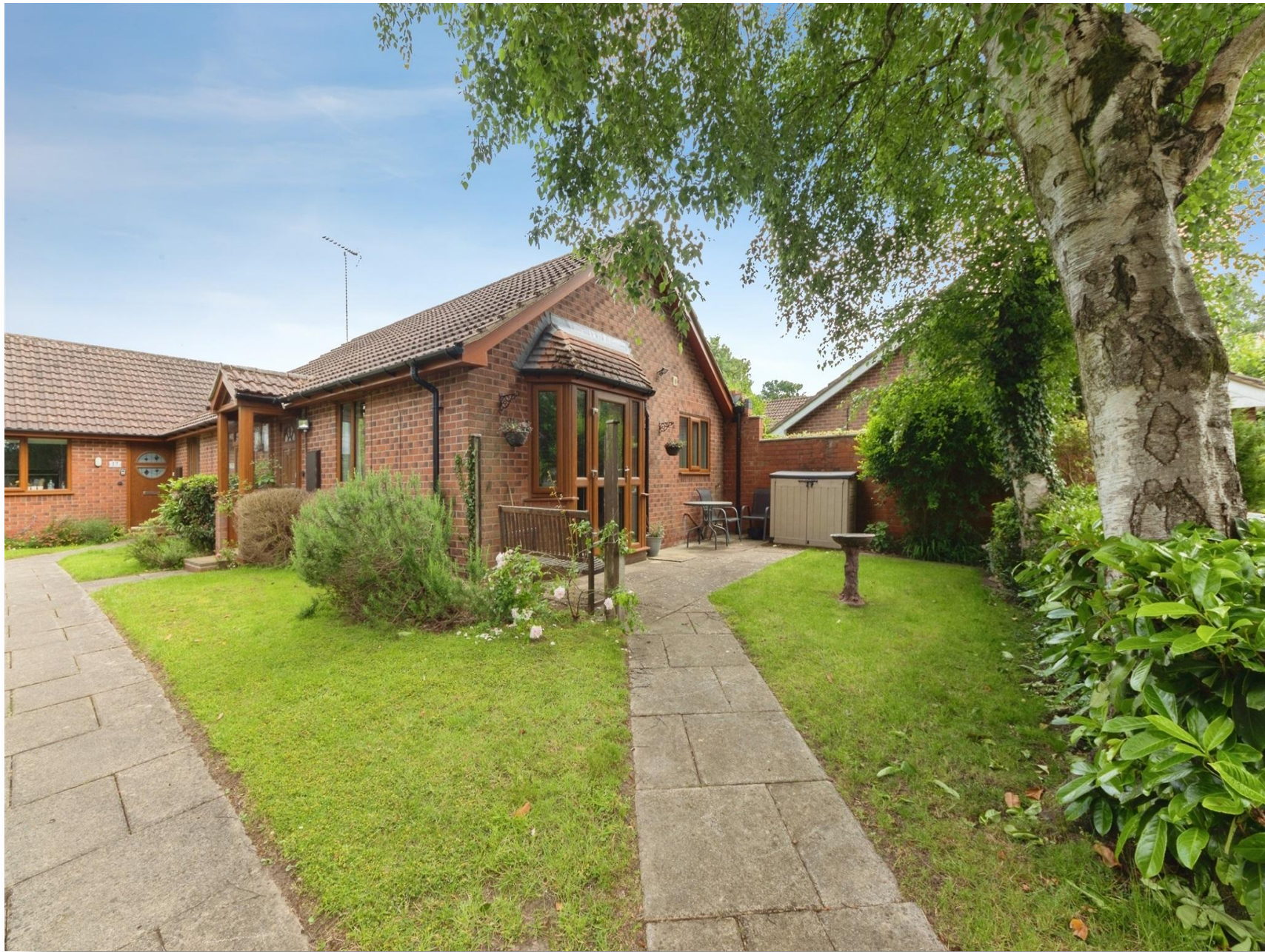
Portershill Drive, Shirley Solihull B90 4DS