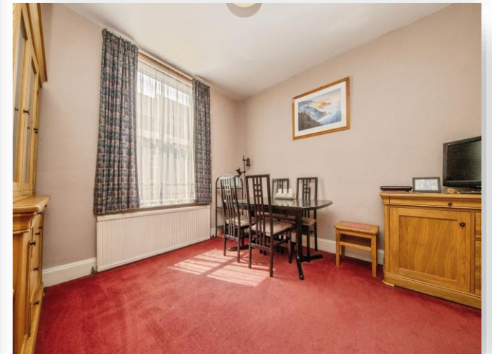
Palmerston Road, Ipswich, IP4 2LN