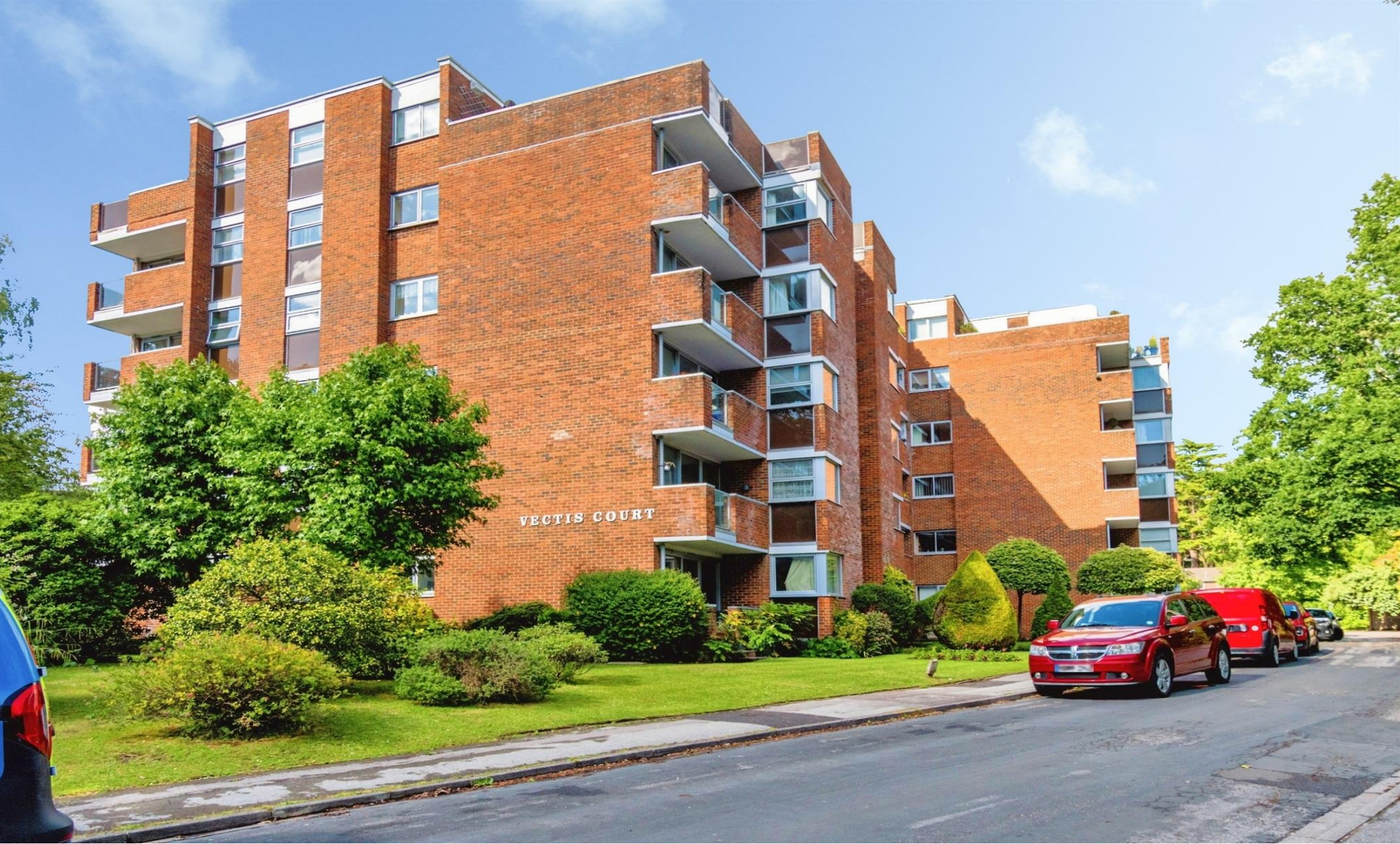
Vectis Court, Talbot Close, Southampton SO16 7LY