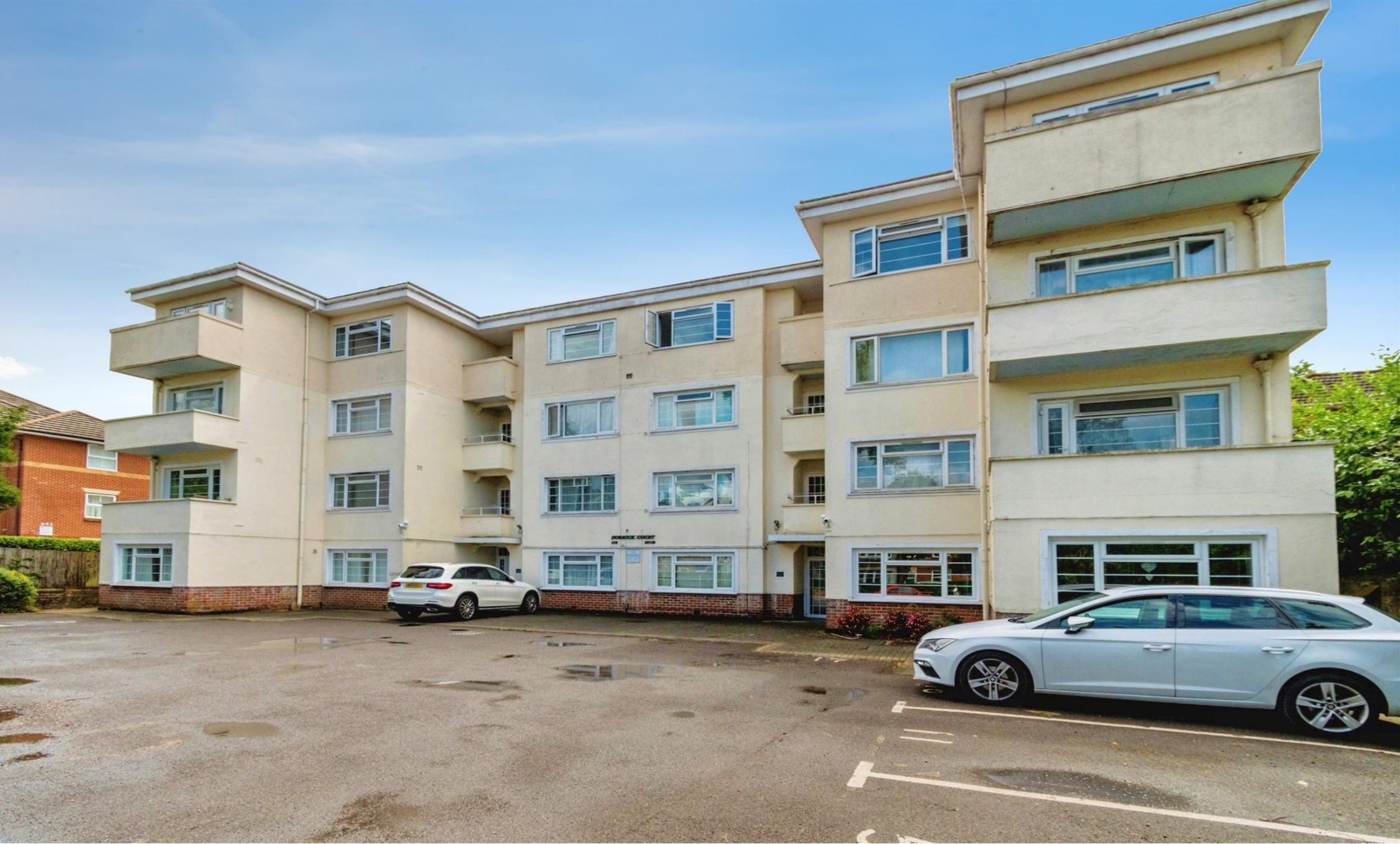
Dorrick Court, Archers Road, Southampton SO15 2LT