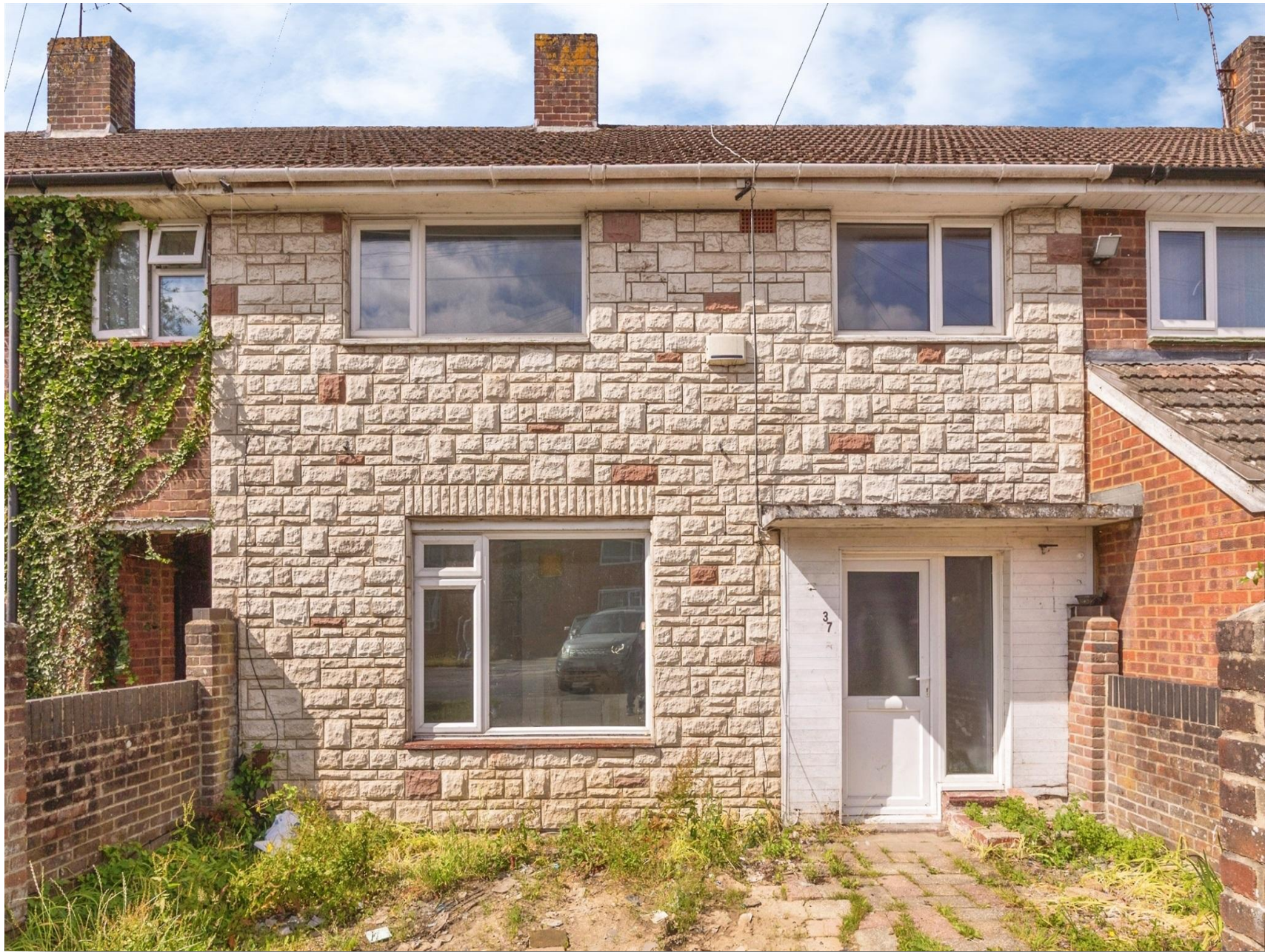
Botley Drive, Havant PO9 4PH