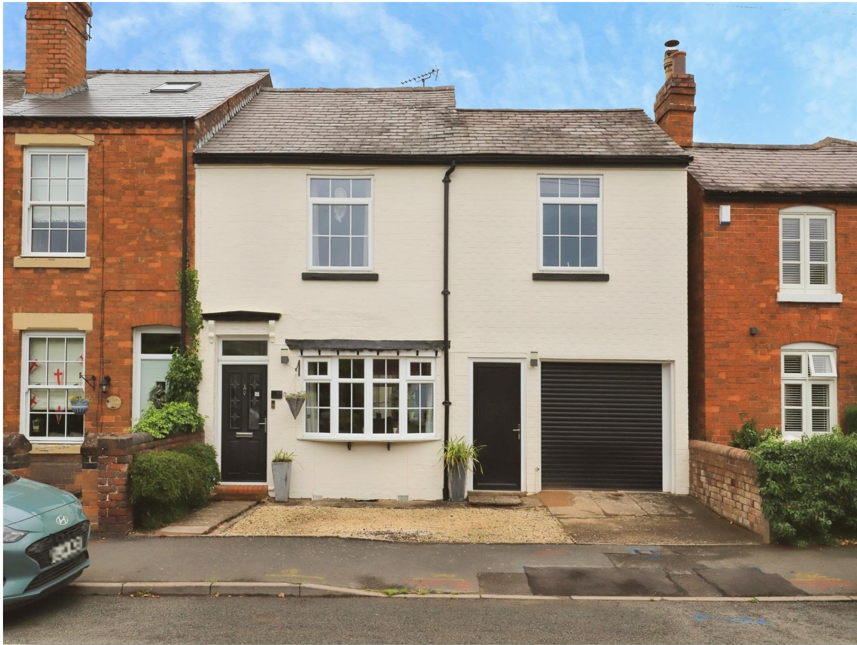
Belbroughton Road, Blakedown KIDDERMINSTER DY10 3JG