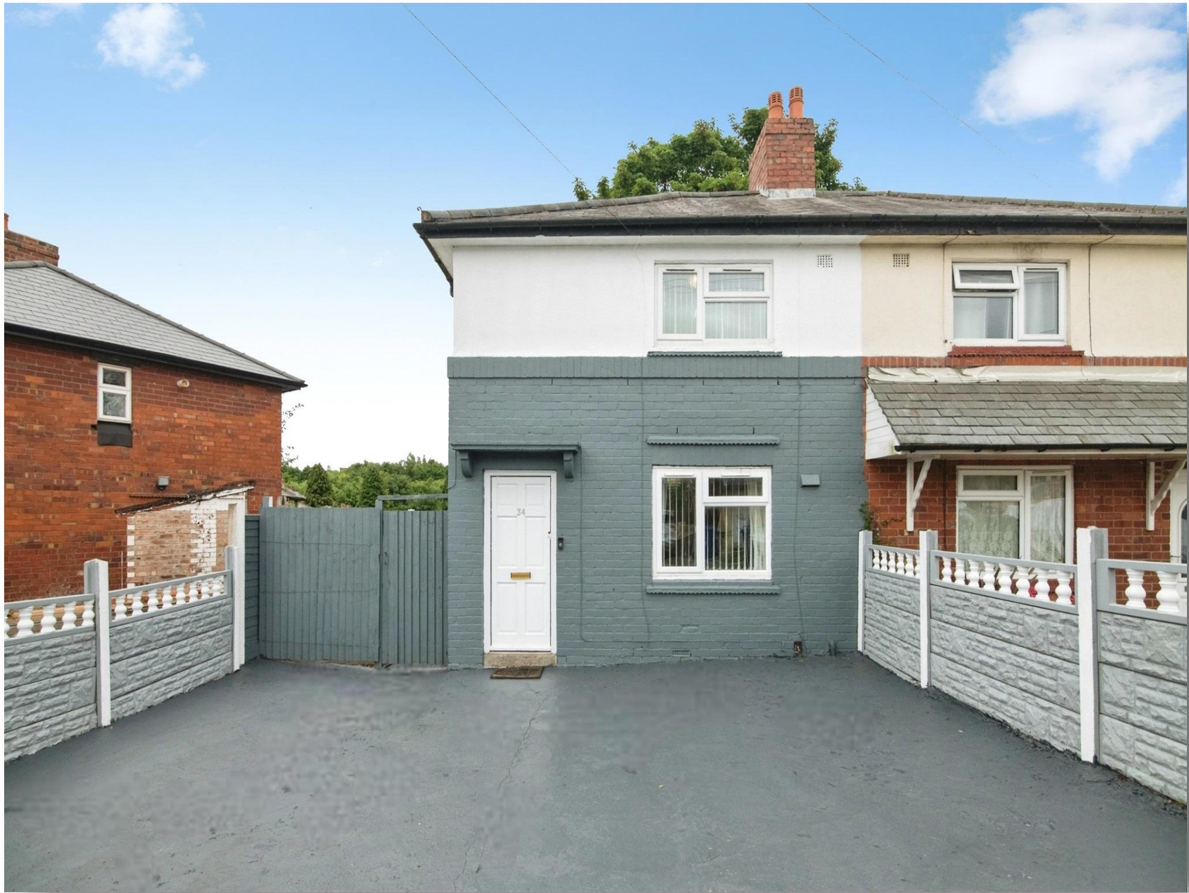
Tansley Hill Avenue, Cawney Hill Dudley DY2 7NQ