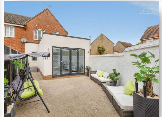
Columbine Road, Horsford Norwich NR10 3RT