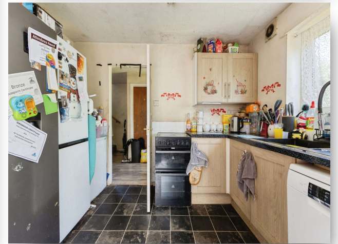
Nightingale Drive, Taverham Norwich NR8 6TR