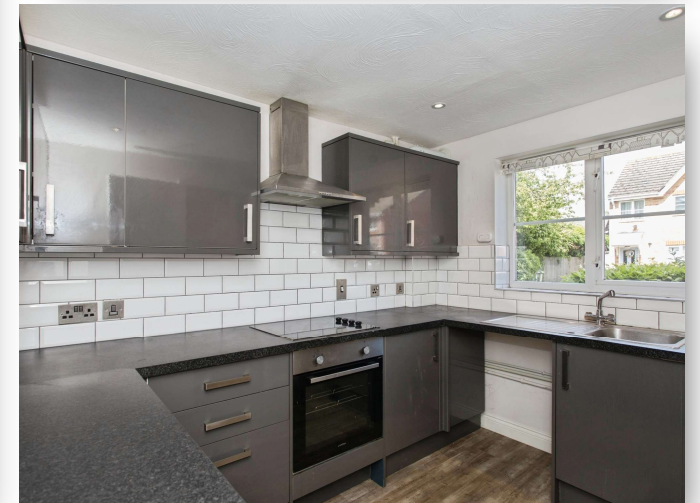
93 Saxon Way, Willingham, Cambridge, CB24 5UR