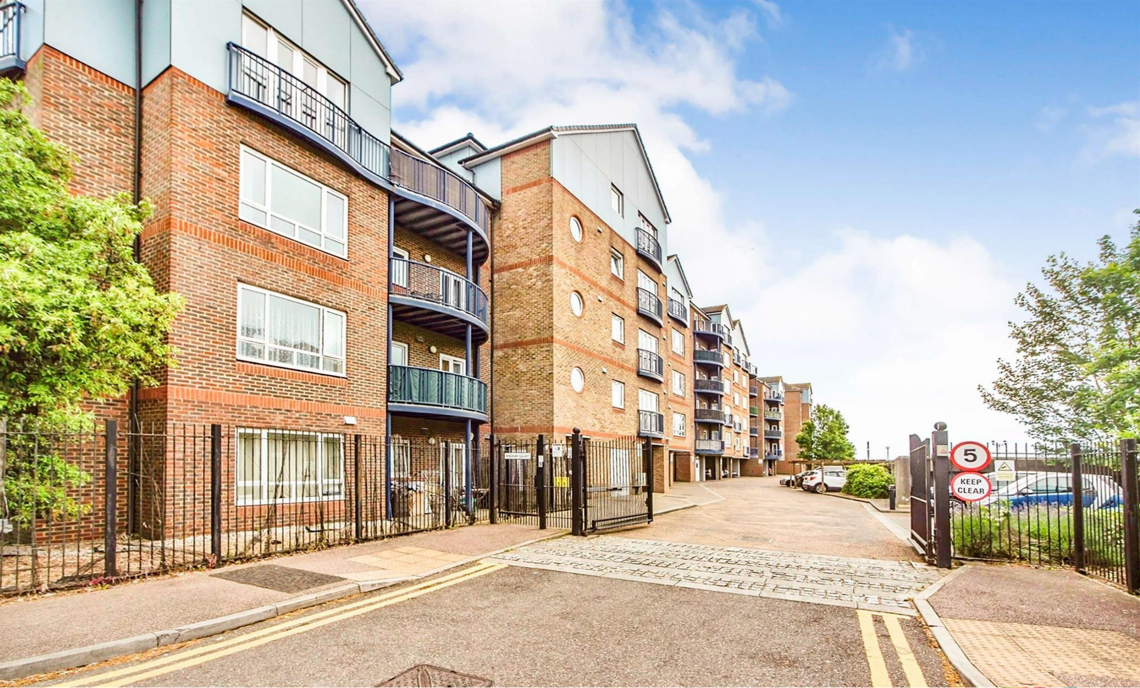
Anchor Court, Argent Street, Grays RM17 6QN