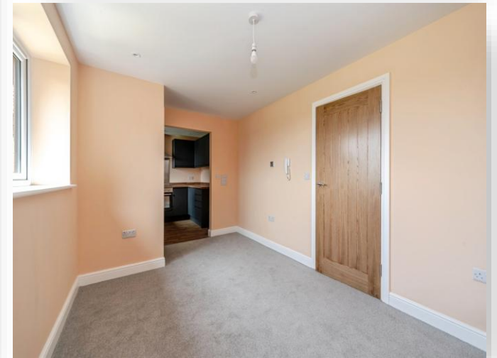
Redwood Grove, Bedford, MK42 9JL