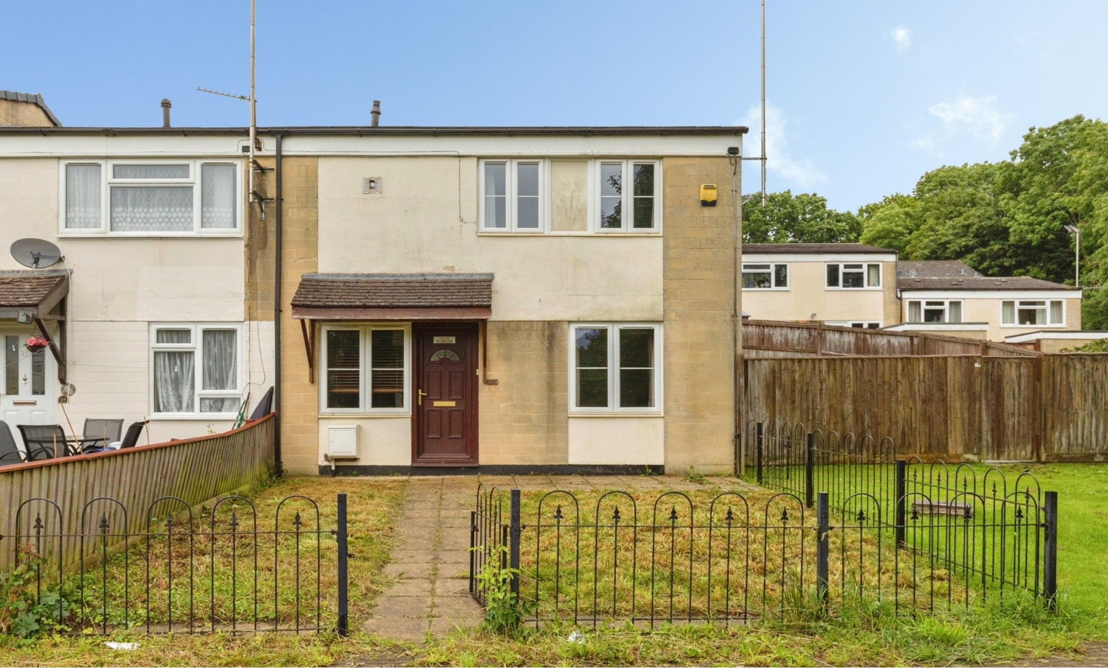
Redland Park, Bath BA2 1SL