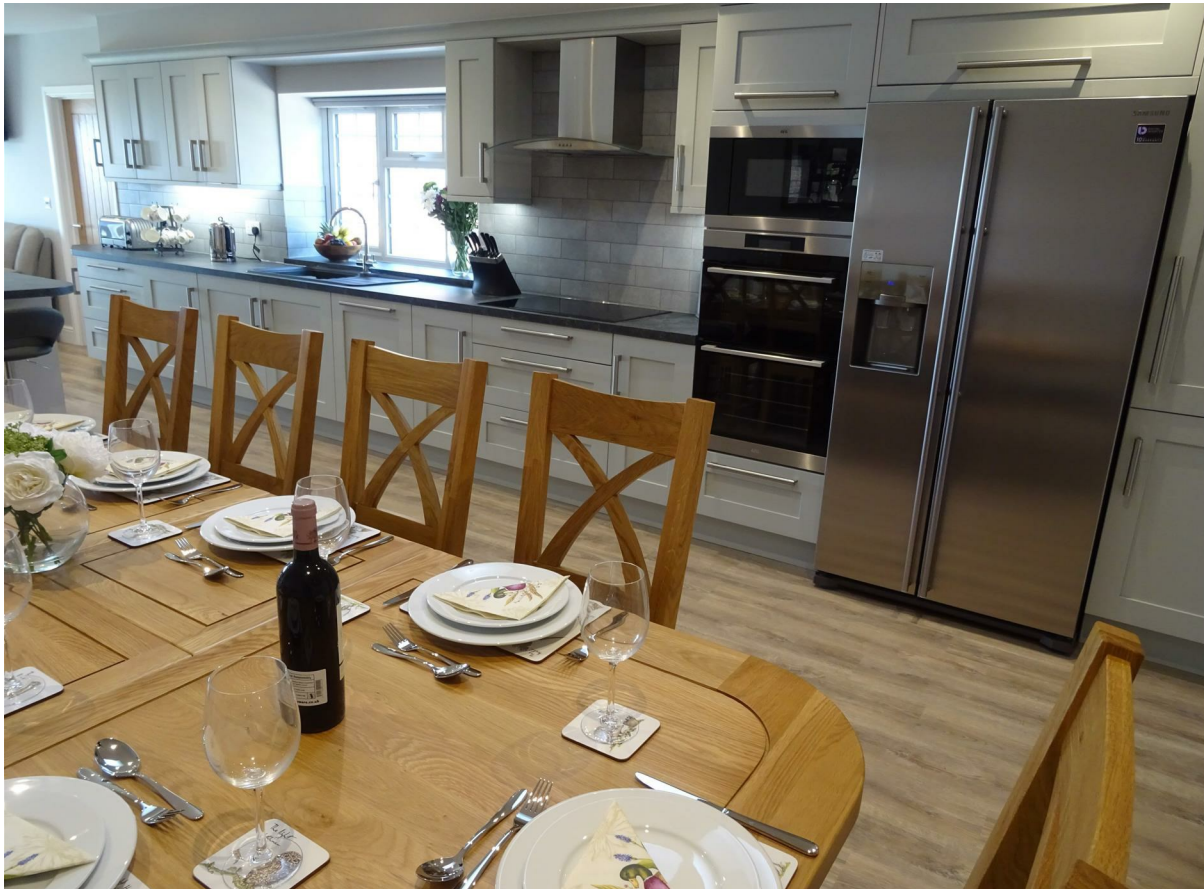
Woodys Top, Ruckland, Louth, Lincolnshire, LN11 8RQ