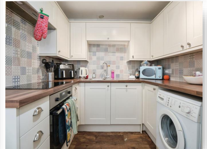
West End House, West End Road, Southampton SO18 6PA