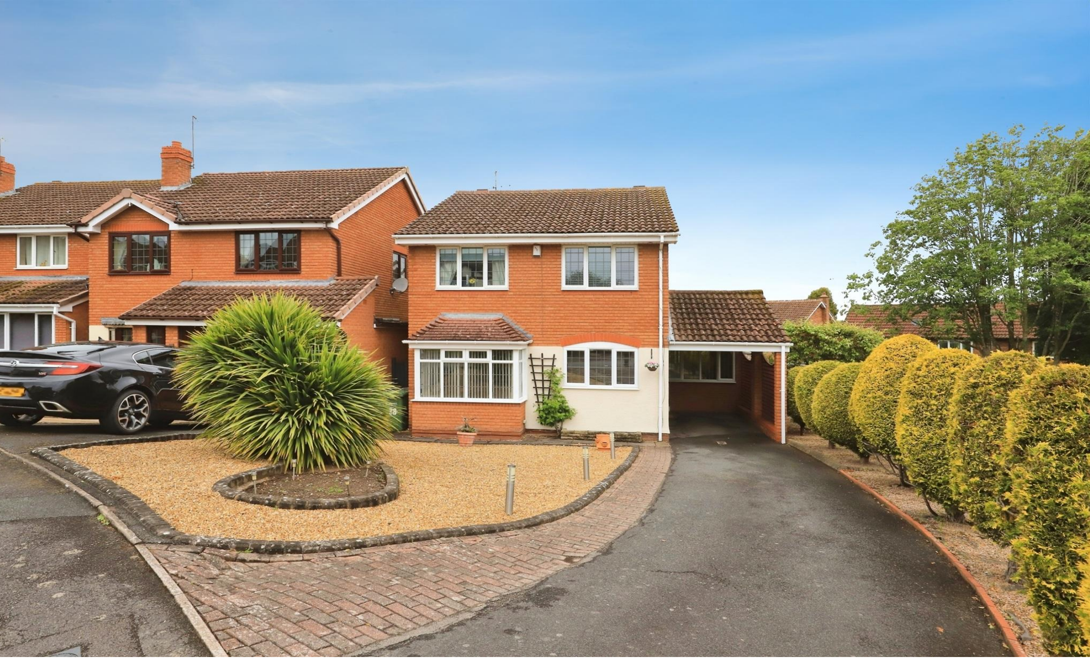
Serin Close, Kidderminster DY10 4TY