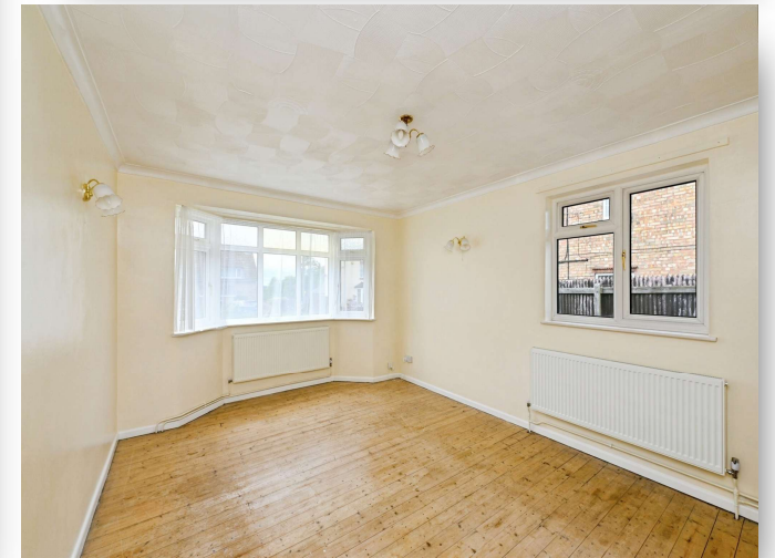
Westgate Street, Southery, Downham Market, PE38 0PA