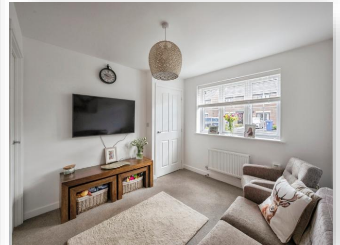
Bluebell Way, Thurnscoe Rotherham S63 0FS