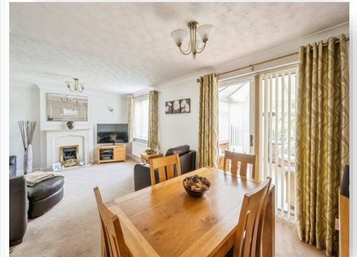
Mulberry Close, Goldthorpe Rotherham S63 9LB