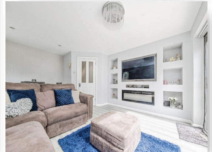
Ladbrook Drive, Colchester, CO2 8RW