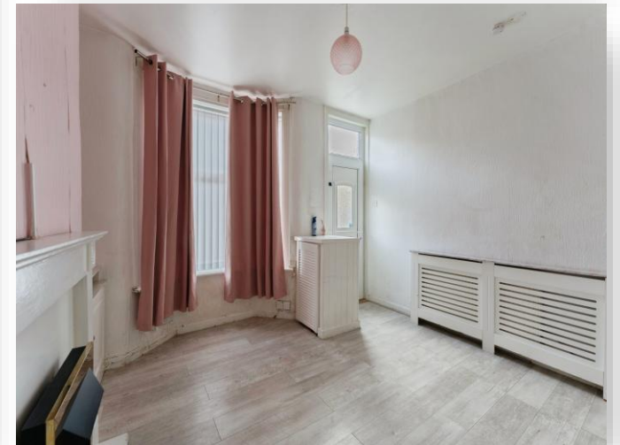
Moorland Road, Tranmere, Birkenhead, CH42 5NX