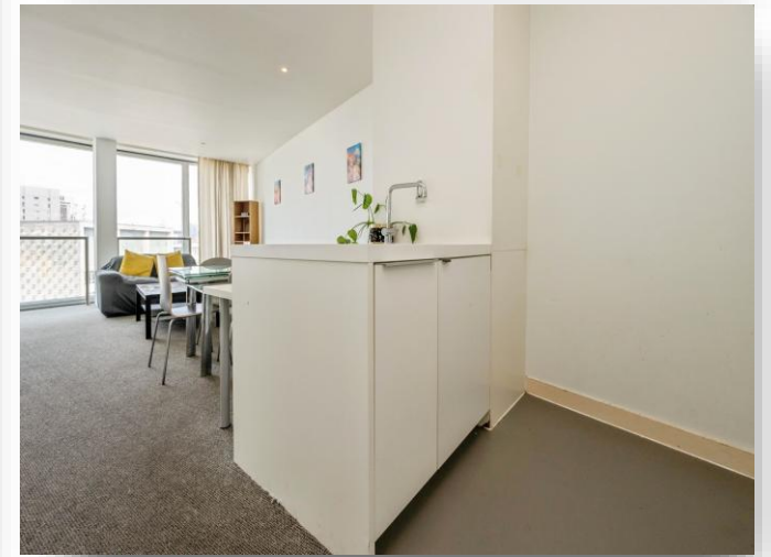
The Rotunda New Street, Birmingham B2 4PE