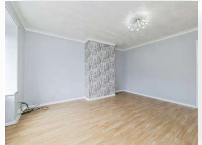
Leazes Rise, PETERLEE SR8 5RF