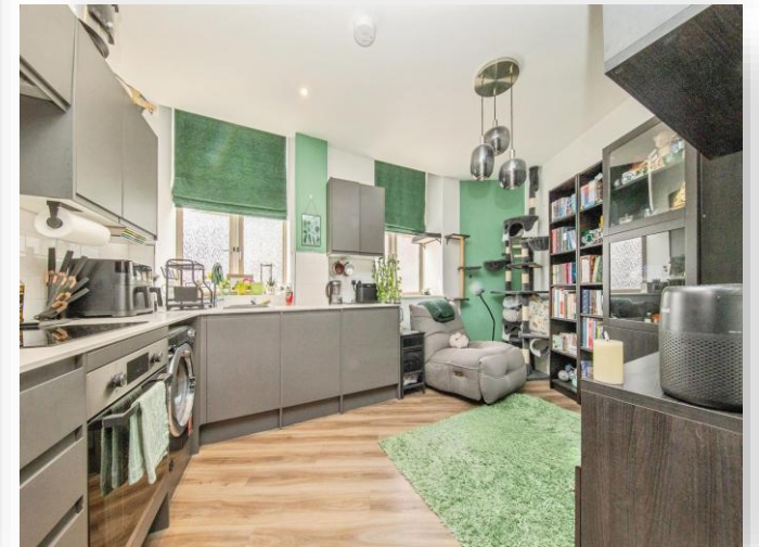
Century House, Princes Street, IPSWICH, IP1 1PU