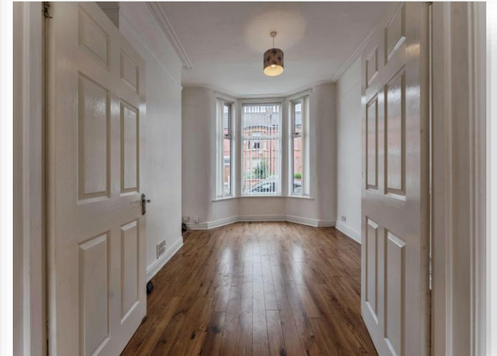
Aspinal Street, Birkenhead, CH41 4HZ