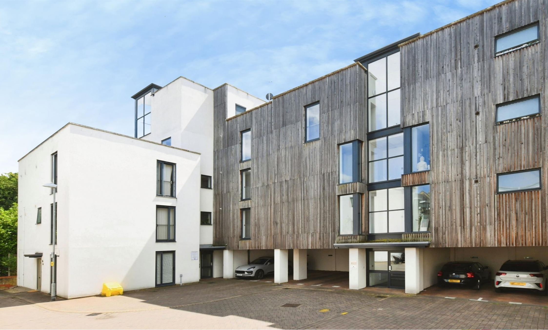
Hardy Close, Chelmsford CM1 1AE