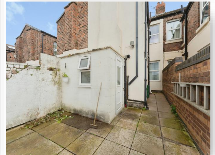
Cloughton Road, Birkenhead, CH41 4DX