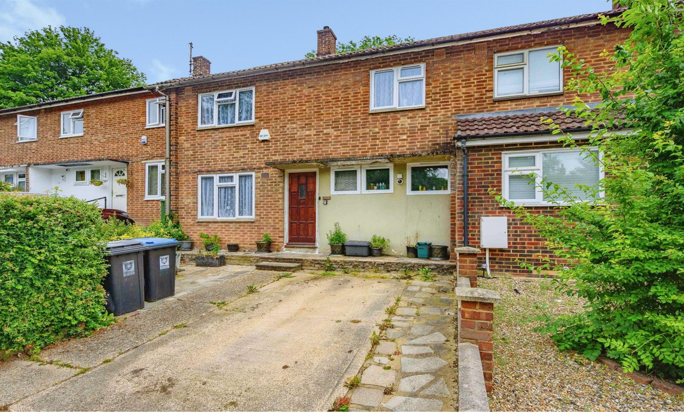
Barnacres Road,HEMEL HEMPSTEAD HP3 8JR