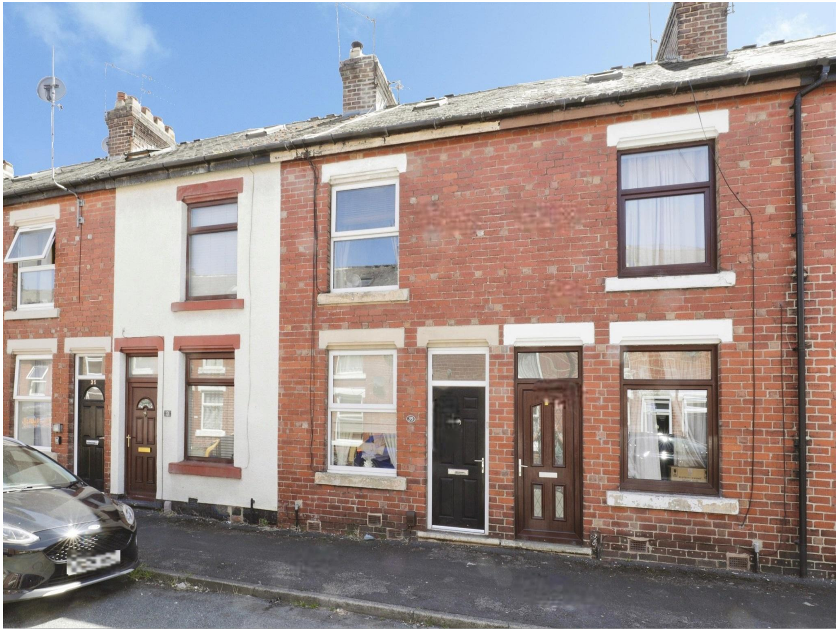
Avenue Grove, Harrogate HG2 7PD