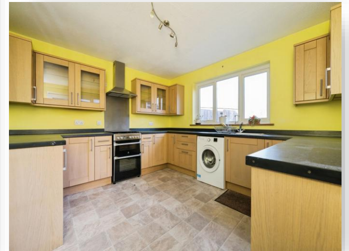
Cypress Avenue, Southampton SO19 7LD