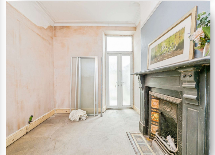
Claude Road, Roath Cardiff CF24 3QB