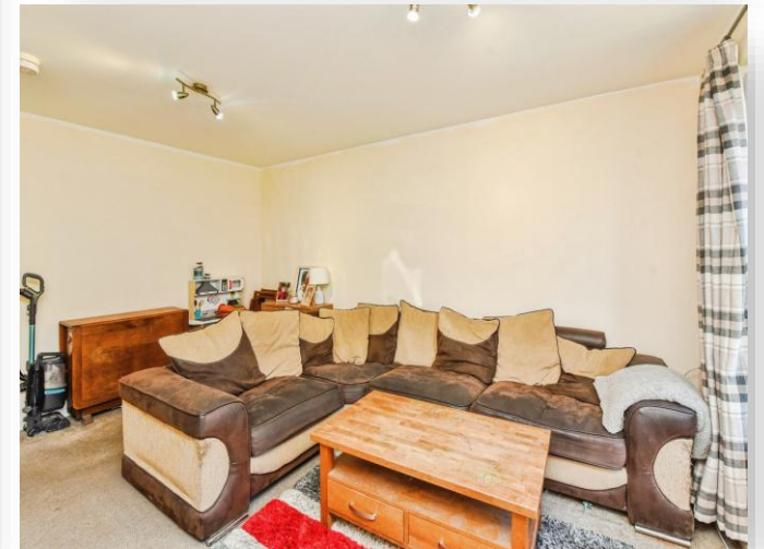
Combe Walk, Devizes SN10 2HE