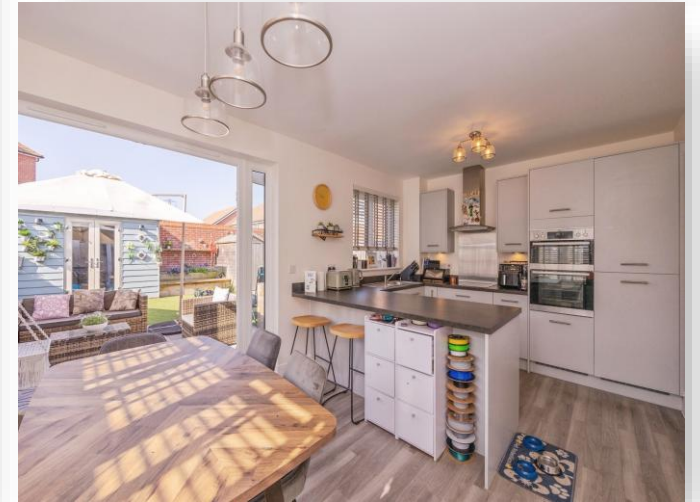
Purkis Road, Waterlooville PO7 3DW