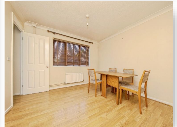
Sittang Close, COLCHESTER CO2 9RB