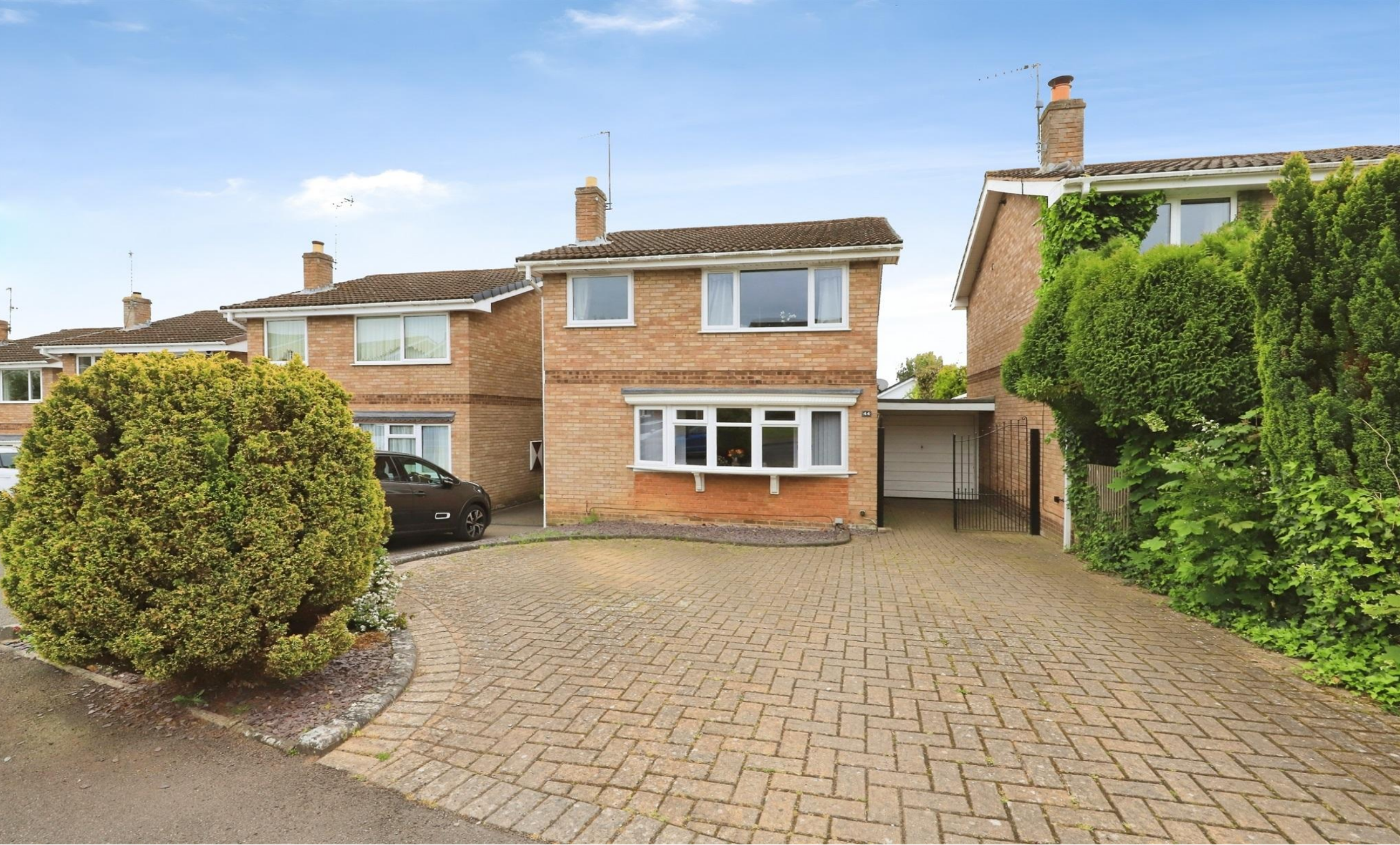
Coniston Way, Bewdley DY12 2PP