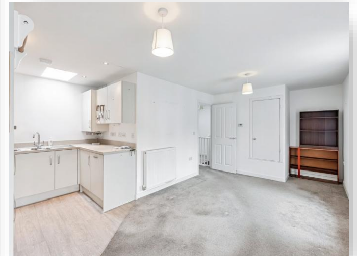
Waterside Road, Wellingborough NN8 1PD