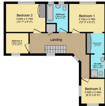
First Floor Floor area 59.1 sq.m. (636 sq.ft.)

Total floor area: 150.4 sq.m. (1,619 sq.ft.)