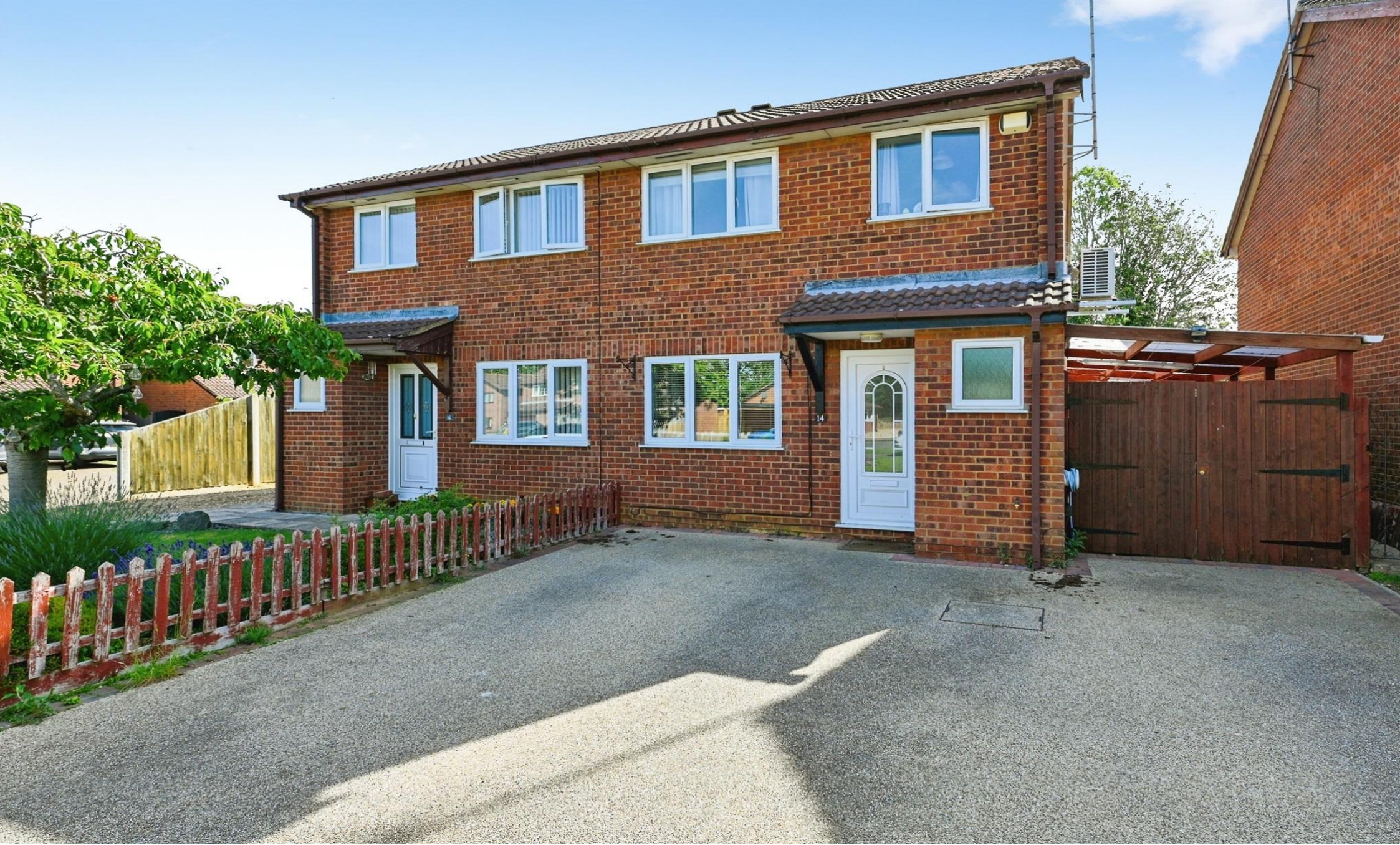
Stody Drive, South Wootton, King's Lynn, PE30 3UQ