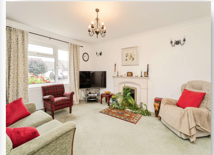
Sheldrake Close, Fakenham, NR21 8ND