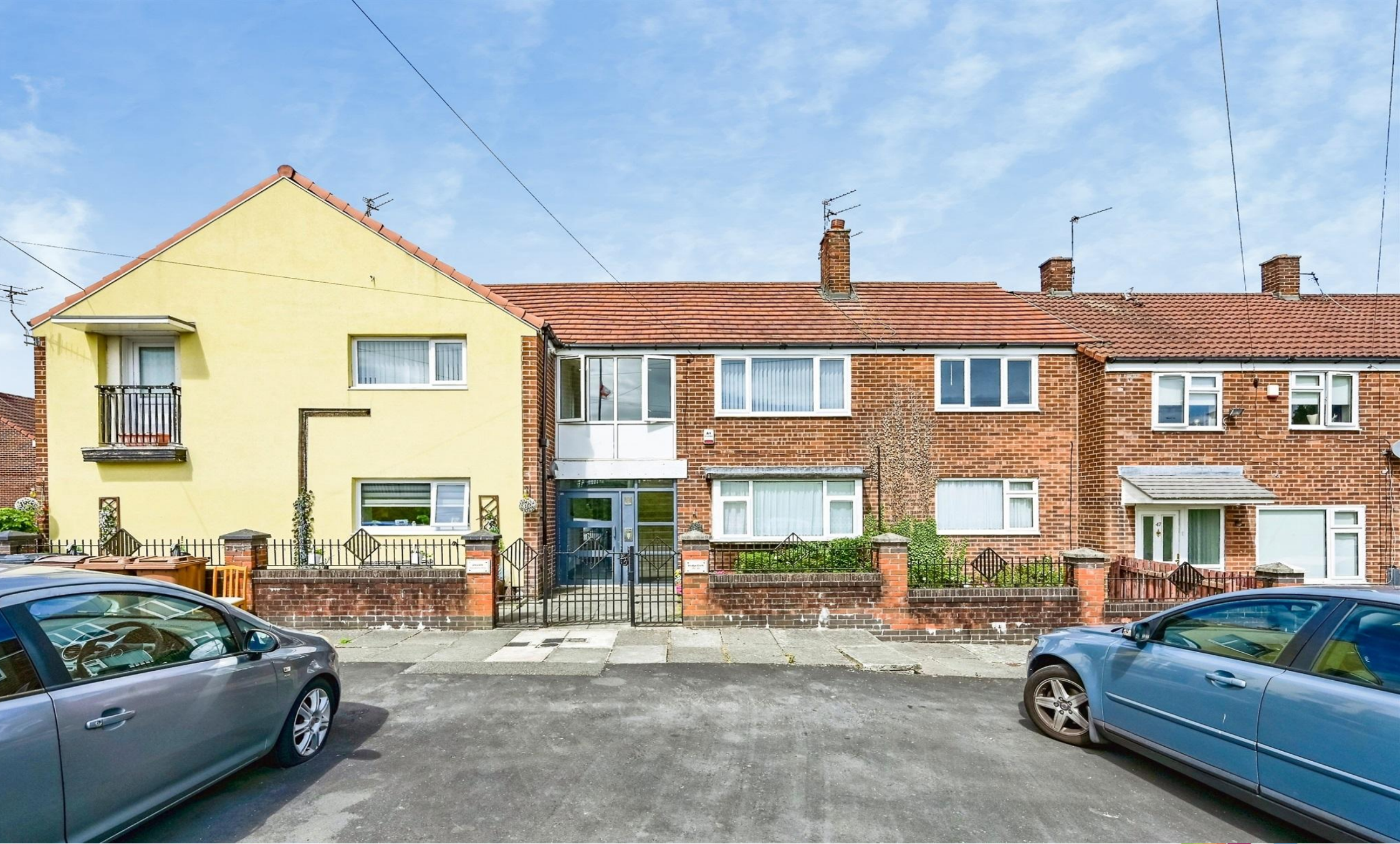
Bridge Croft, Liverpool L21 0HJ