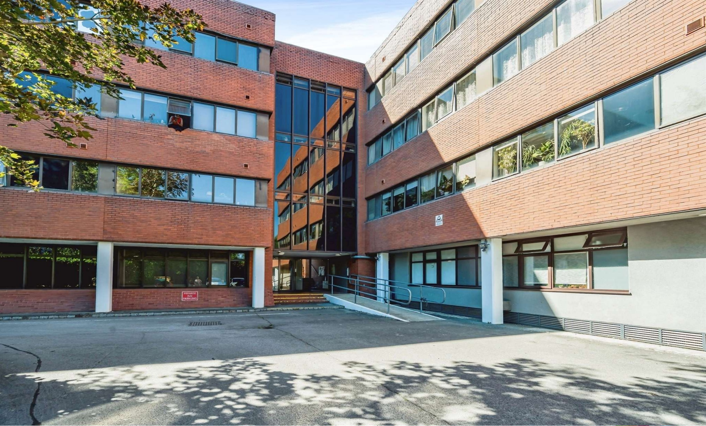
Kingfisher House Walton Street, Aylesbury HP21 7FS