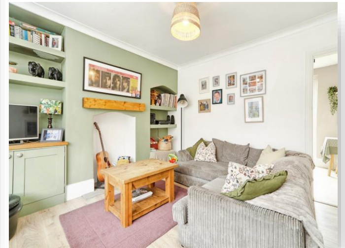
Low Ash Avenue, Shipley BD18 1JJ